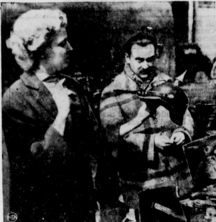
"PUT ON THAT OLD WAR BONNET"—Mademoiselle debates the wisdom of buying a choice bit of World War I millinery, a German officer's helmet, from among thousands of items on display at the traditional springtime Paris Scrap Metal Fair. Monsieur, on the other hand, shows by his expression that Amazons, with war bonnets, are not to his liking.

WARNER BROS. The Lion and the Horse STEVE COCHRAN WALTER THE WICKED HORSE NEWS AND CARTOON