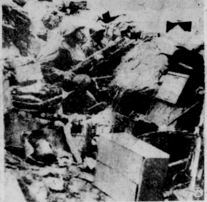
NO END IN SIGHT —As the second anniversary of the Korean war arrives, fighting continues on a stepped up scale. From the litter of their slit trench, two soldiers of the 180th Infantry Regiment keep a sharp watch for enemy movements following a fierce engagement in the area.

For Good Use! (Trade-ins on the Osborne Motor Car)