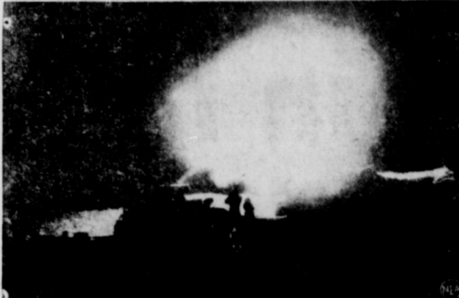
DAY AND NIGHT—There's more than snow falling in Korea. Day and night, around the clock, United Nations artillery is pounding hill positions held by the North Korean and Chinese Communist forces. At top an 8-inch howitzer fires on enemy positions on the Triangle Hill sector of the front. At bottom, a battery goes into action during the night. Artillery duels are stepping up as troops begin to dig in for the winter.