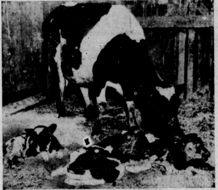
M-O-O-RE THAN SHE EXPECTED — "Mama" Holstein, of Merced, Calif., is understandably proud of her four calves. Quadruplet births in the bovine world are extremely rare, and it is seldom that all four calves survive, as did the quartet, above.