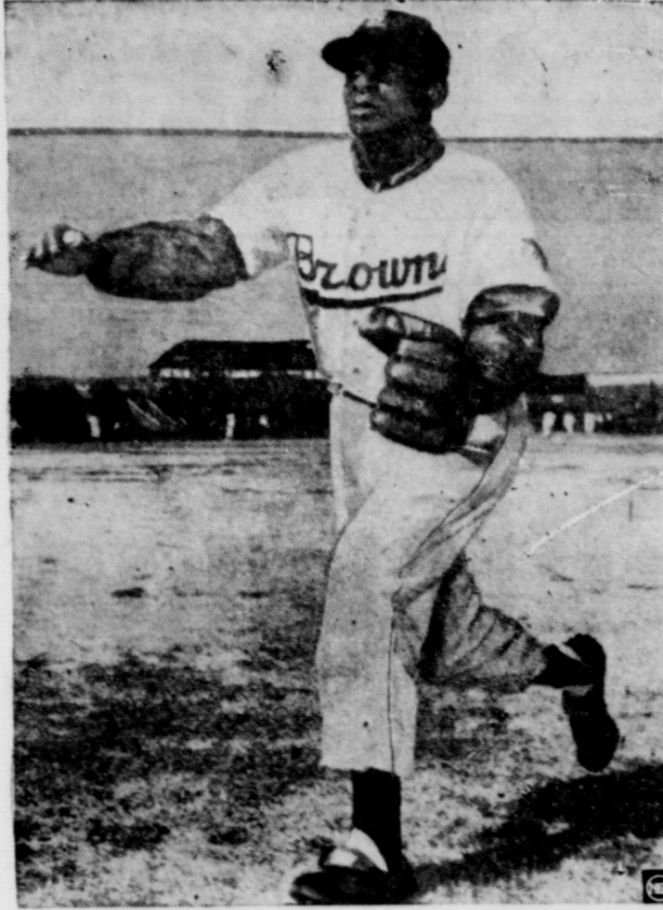
LAST FLING—Ol' Satchel Paige, an admitted 45, warms up his arm at the St. Louis Browns' San Bernardino, Calif., training camp before taking his turn on the mound. The veteran pitcher, who had a 12-10 record in 1952, says this positively will be his last season.

MONEY TO LOAN For Repairs and Remodeling Your home need not be debt free. Consolidate your payments into one. CALL 766-J