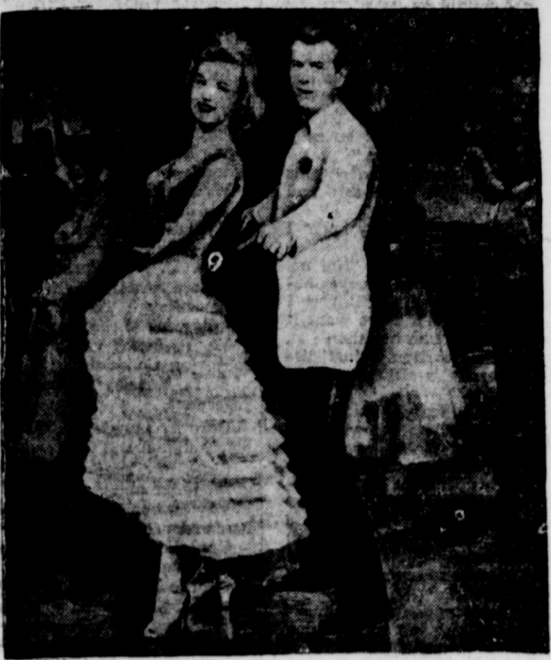
"She's Back on Broadway" starring Virginia Mayo, showing at the Majestic Theatre in Eastland Sunday, Monday.