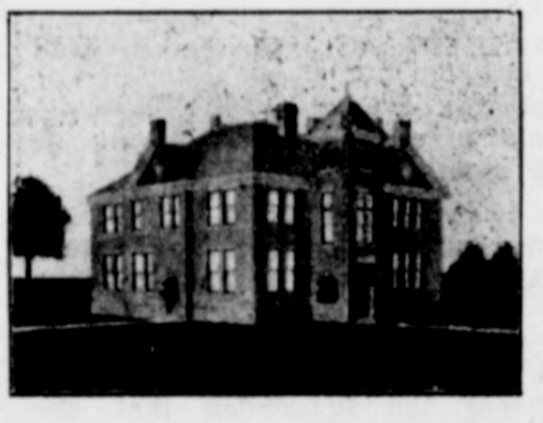
Merkel Public School Building

The Review needn't get it into his head that we are going to pack the building up there for him to look at, for we are not. Besides, Sweetwater has a knack of holding on to every good thing that comes her way, and if she should find an enterprise of the value of the Merkel school building floating around, it would be "strayed" forthwith and immediately. If the Review has to be shown, let it gaze on the following picture and weep: