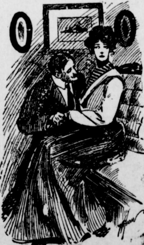
"Will You Help Me?"

It is perhaps hardly necessary to say that the girl was as pretty as a