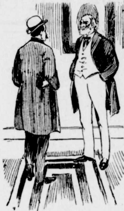
Unbosomed Himself to a Friend of Experience.

"The longer most habits continue the stronger they get," observed the person of experience, "but it's different with this one. To begin with, it is seldom well nourished after it gets well started; it becomes hollow-