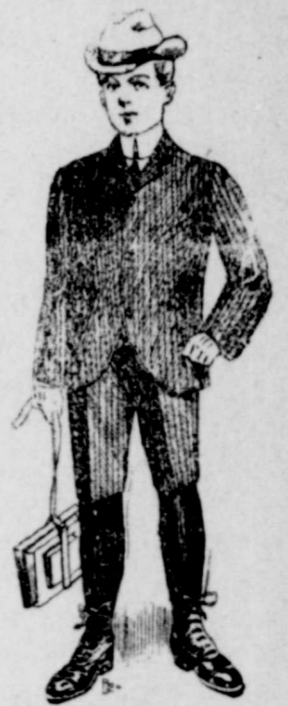
We'll take your order for patterns and furnish free fashion plates.

Youths suits, all sizes and colors, all bargains, at only 3.50, 5.00, 6.50, 8.50 and 10.00 Just received a shipment of ladies and childrens jackets, better than ever, from 1.00 to 5.00 Mens heavy cotton overshirts, the "kant wear out" kind, at 1.00 and 50c Mens wool overshirts, all colors and weights, at 2.00, 1.75, 1.50 and 1.00 We have a big line of wool and cotton underwear for men and boys at from 25c to 1.50 A large assortment of wool and cotton blankets at, a pair, from 50c to 6.00 We are still selling the ladies and boys extra heavy bicycle hose, worth 25c, at only 15c Just received another large shipment of millinery goods that figures a saving to you of 25 per cent. We are sole agents in Merkel for the Standard Patterns. We'll take your order for patterns and furnish free fashion plates.