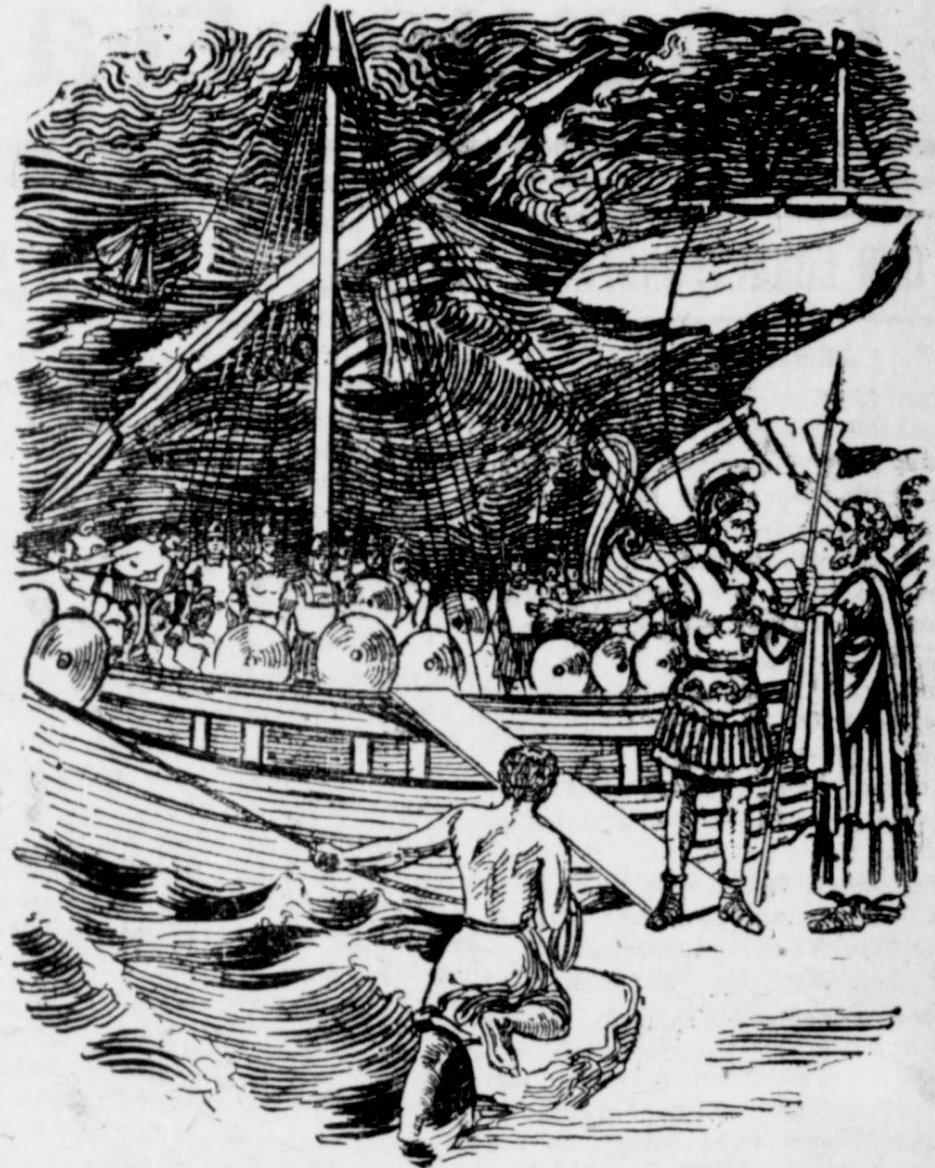
THE PATRIOTISM OF POMPEY.

D URING a famine the Roman government commissioned Pompey to procure food from foreign countries and when the expedition was confronted by an angry sea and he was urged to delay in order to avoid danger, he replied, "It is not necessary that I live, but it is necessary that I go," and he went. The human race moves forward only when it has great men to meet the emergencies of civilization and a citizenship that applauds self-sacrifice in leadership.