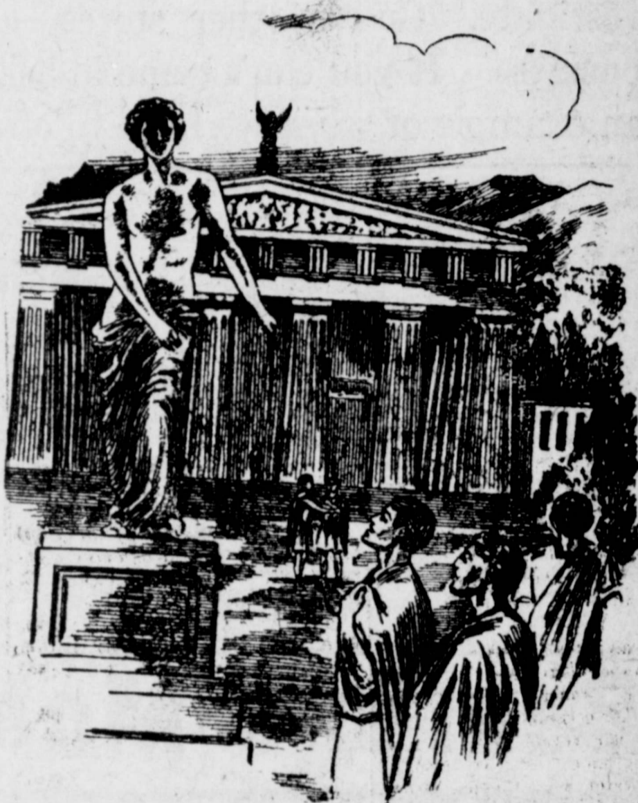
THE GREEKS LOVED BEAUTY.

There is no nobler deed than to plant in the garden of civilization flowers that will blush and bloom and shed their fragrance to future generations.