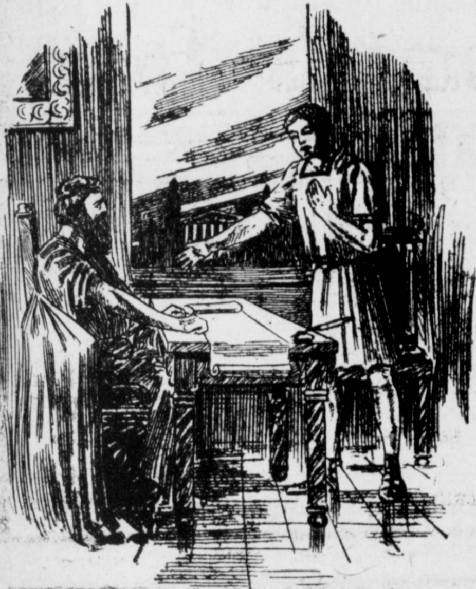
PLATO REPREHENDING HIS PUPIL.

Many of our citizens vote a ticket according to custom without reference to party platform or to the ability of candidates. We can permit ourselves to be such complete slaves of custom that we lose our identity and become the property of politicians. No country can prosper where the noble impulses of progress are fettered by the coils of custom and whose citizens follow its blind adherence the paths of habit.