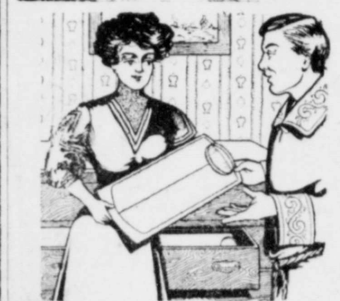
"HAVE I A CLEAN SHIRT?"

Chapped skin, whether on the hands or face, may be cured in one night by applying Chamberlain's Salve. It is also unequalled for sore nipples, burns and scalds. For sale by all dealers. adv