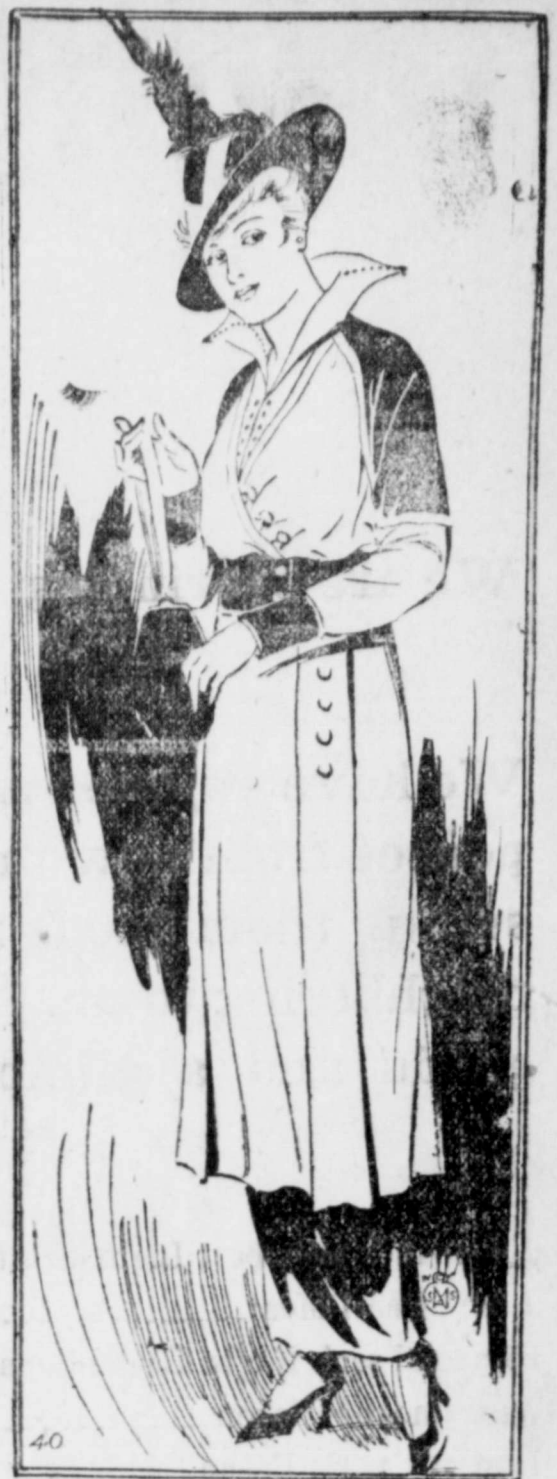
$25 SUIT $17.50