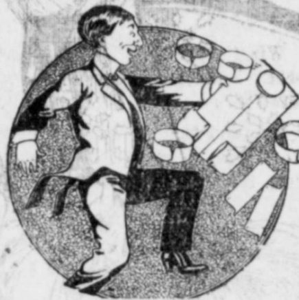
IT'S A HAPPY MAN