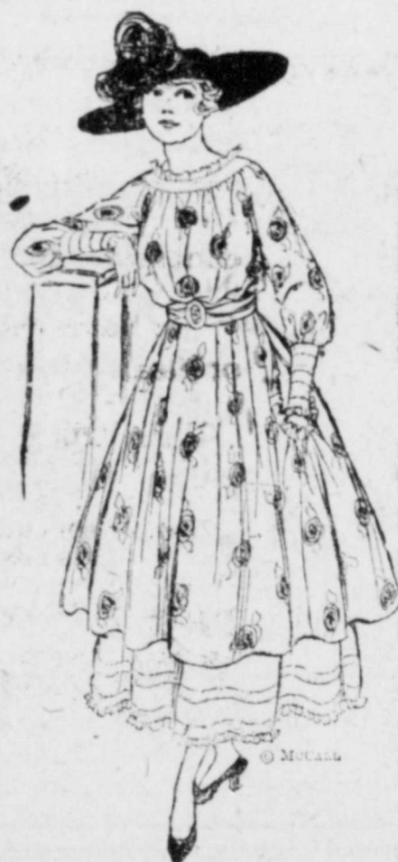
Ribbon a Fashionable Trimming

The two illustrations shown here are typical of the simplicity of the present styles. The dress of checked taffeta has a gored skirt with pannel front and back, and of course you know it