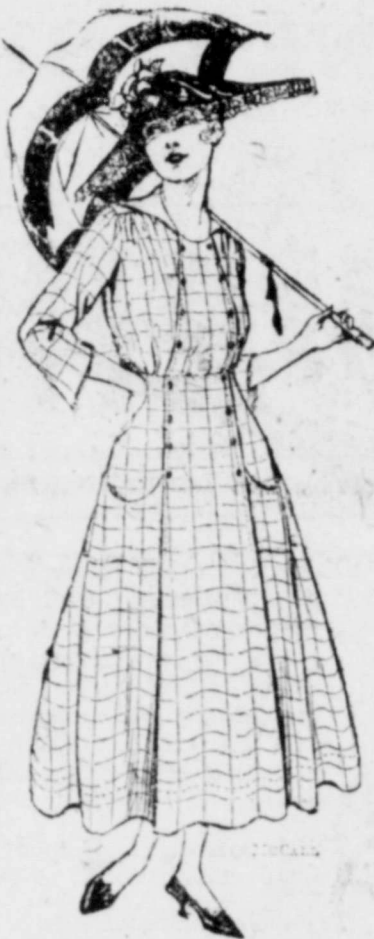
Dress of Checked Taffeta

At all fashionable resorts, parasols of bright hues and fancy shapes are strongly in evidence. They are in all colors, both in self tones and in effective combinations of two harmonizing col-