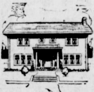
The Modern Colonial

And all kinds of Blood sucking insects, by feeding Martins Wonderful Blue Bug Killer to your chickens. Your money back if not absolutely satisfied. Ask Sanders Drug Store. Feb 6/26