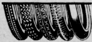
ROYAL CORD - NOBBY-CHAIN-USCO-PLAIN

For best results—everywhere—U. S. Royal Cords.