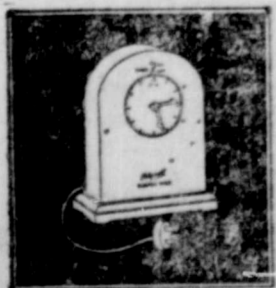
Hotpoint Automatic Electric Timer. Set the hands for the time cooking should start and stop. Then forget it.

"And it will be better than when I had to fuss with it in a hot, stuffy kitchen."