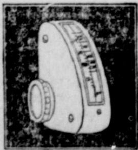
Hotpoint Automatic Electric Heat Control and Thermome- ter. It maintains an exact oven heat, as desired, all through cooking.

Come in and let us tell you about the many other advantages of the Hotpoint Electric Range.