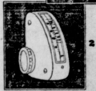
1 Hotpoint Automatic Electric Timer. Set the hands for the time cooking should start and stop. Then forget it. 2 Hotpoint Automatic Electric Heat Control and Thermometer. It maintains an exact oven heat, as desired, all through cooking.

Hotpoint SUPER-AUTOMATIC ELECTRIC RANGES