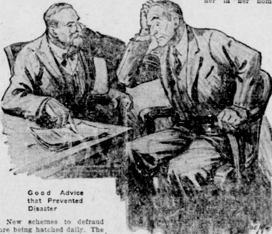
Good Advice that Prevented Disaster

others you know nothing about. Some time you may be approached to make a trade by a plausible person claiming to have better investments to offer than those you have. Recently a woman owning a block of gilt-edge public utility stock was approached by two smooth sharpers and urged to exchange it for stock in a fruit company which, she was told, was not only very valuable then but would increase rapidly in value and soon make her independently wealthy. Fortunately she told her neighbor about her offer. It happened that the neighbor had recently been defrauded in a similar way. She advised the second woman to report her offer to the local better business bureau. Having handled many similar situations the bureau instructed the woman to make an appointment for the traders to meet her in her home.