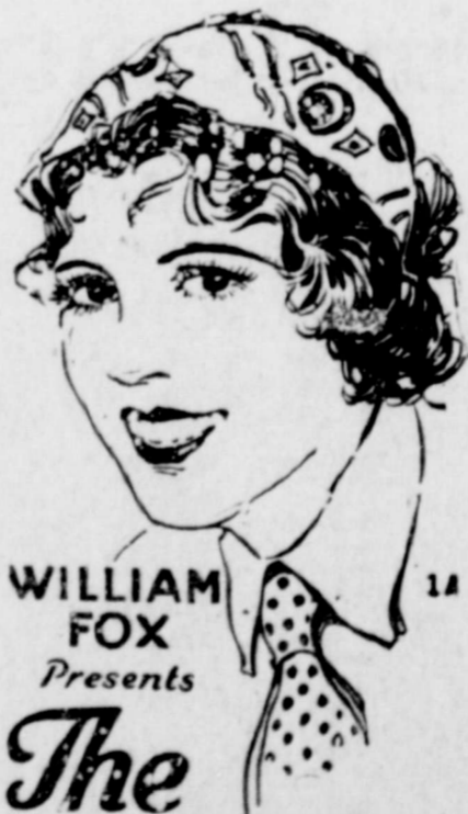
WILLIAM FOX Presents