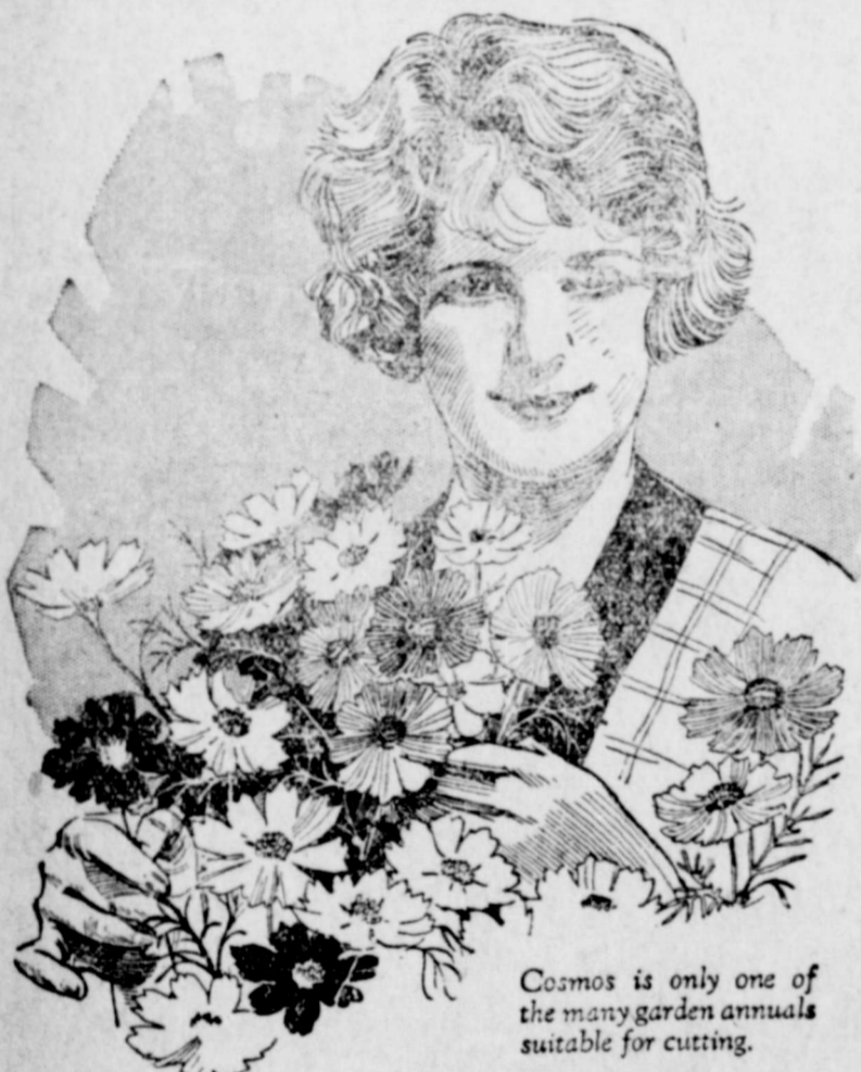
Cosmos is only one of the many garden annuals suitable for cutting.