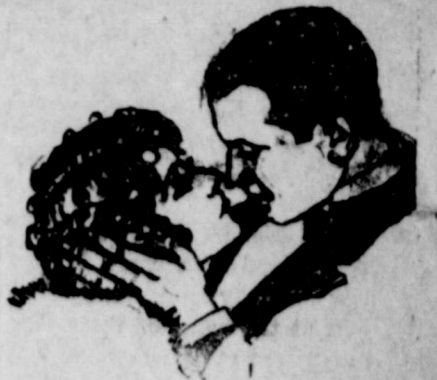
Hear Barthelmess Sing and Play "Weary River"