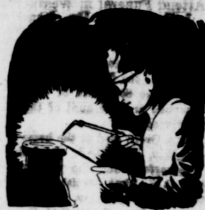
OUR WELDING WORKS WONDERS

in the mending and cutting of all kinds of hard-tempered metals such as iron and steel, bronze, etc. Welding does many things formerly thought impossible with tough metals. If you have machine repairs to make, see us.