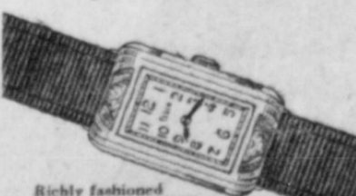
Richly fashioned Elgin wrist watch, $23.75

Here it is, this year, as every year since 1855, the finest gift for graduates is an ELGIN! It's a real lifetime remembrance! Our stock of latest models has just arrived. Exquisite, tiny watches for girl graduates... smart strap or pocket Elgins for the boys. You can find here an accurate, flawless Elgin timepiece to cost just what you wish to pay. So plan to come in soon.