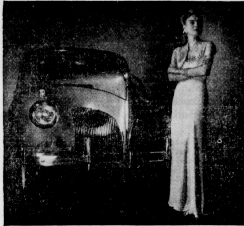
A WHITE Crown Tested rayon dress, with a swirling silver jacket like the radiator of the Lincoln Zephyr Sports Sedan, designed by E. T. Gregorie, head of the Ford Motor Company's Designing Department, for the November Harper's Bazaar. The dress and white plastic bag feature the Lincoln Zephyr motif.