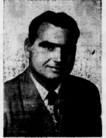
BILLY JOE WHITE

Merkel's new post office is completed. It is a splendid structure, in keeping with the big progress being made here. Merkel citizens are proud of this new addition to our business district. We are proud of the new post