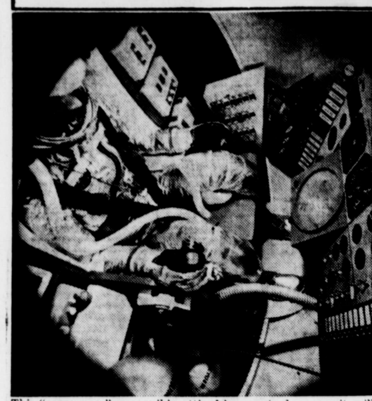
This "space man," a mannikin attired in an actual space suit, will occupy a full-scale model of the Project Mercury Spacecraft which will be exhibited at the 1961 State Fair of Texas in Dallas, Oct. 7-22. The Spacecraft is a capsule like those in which America's first astronauts were launched into space.

ident, welcomed guests in the are earmarked for the benefit of