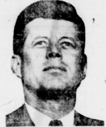
President Kennedy... The hospital bill, not including doctor's and other expenses, will average about $525. The total bill will be about $900. This represents more than one-third of the total yearly income of today's average older couple and only slightly less than the total income of the average older person living alone.

to draw on for medical costs... Second, older people—because of their age—are more likely to need hospital care than younger people and are going to need to be hospitalized longer. The facts are these:—One out of every 6 people 65 or older will be hospitalized during the year and the average stay will be about two weeks, twice as long as the average younger person.