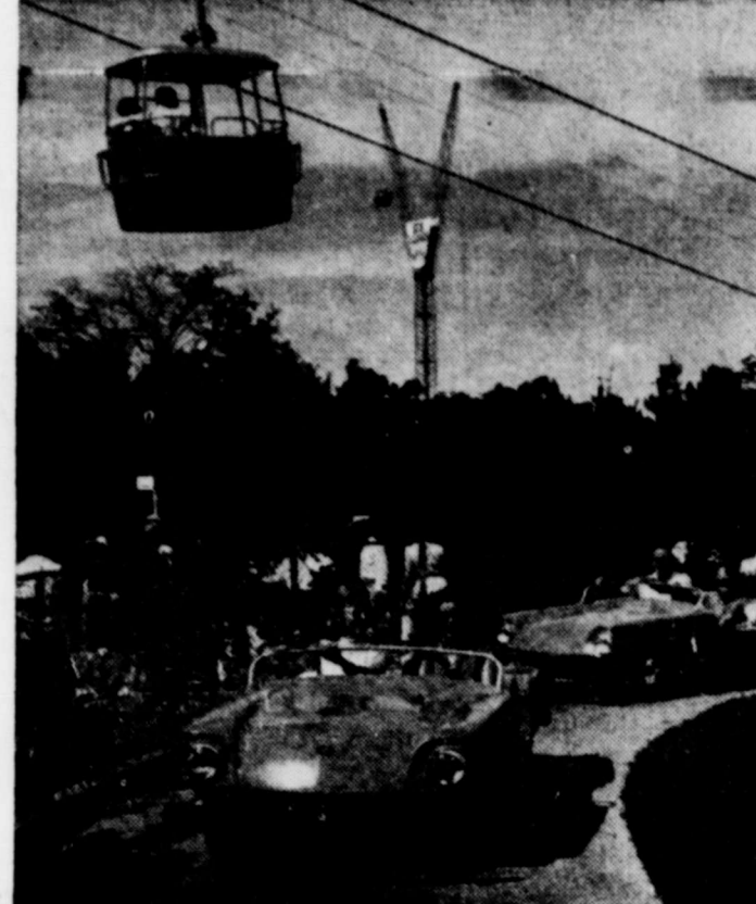
Guests to Six Flags Over Texas are continually surrounded by unlimited vehicles of entertainment. The Happy Motoring Freeway gives visitors an opportunity to drive peppy sports cars around a winding track, while the Astrolift transports visitors overhead from the modern U.S.A. area to the Texas section, 55 feet over the park. In the background is the Sky Hook, with its dual baskets which carries guests up to a height of 155 feet for a spectacular aerial view of Dallas and Fort Worth, and the 115-acre family entertainment center below.