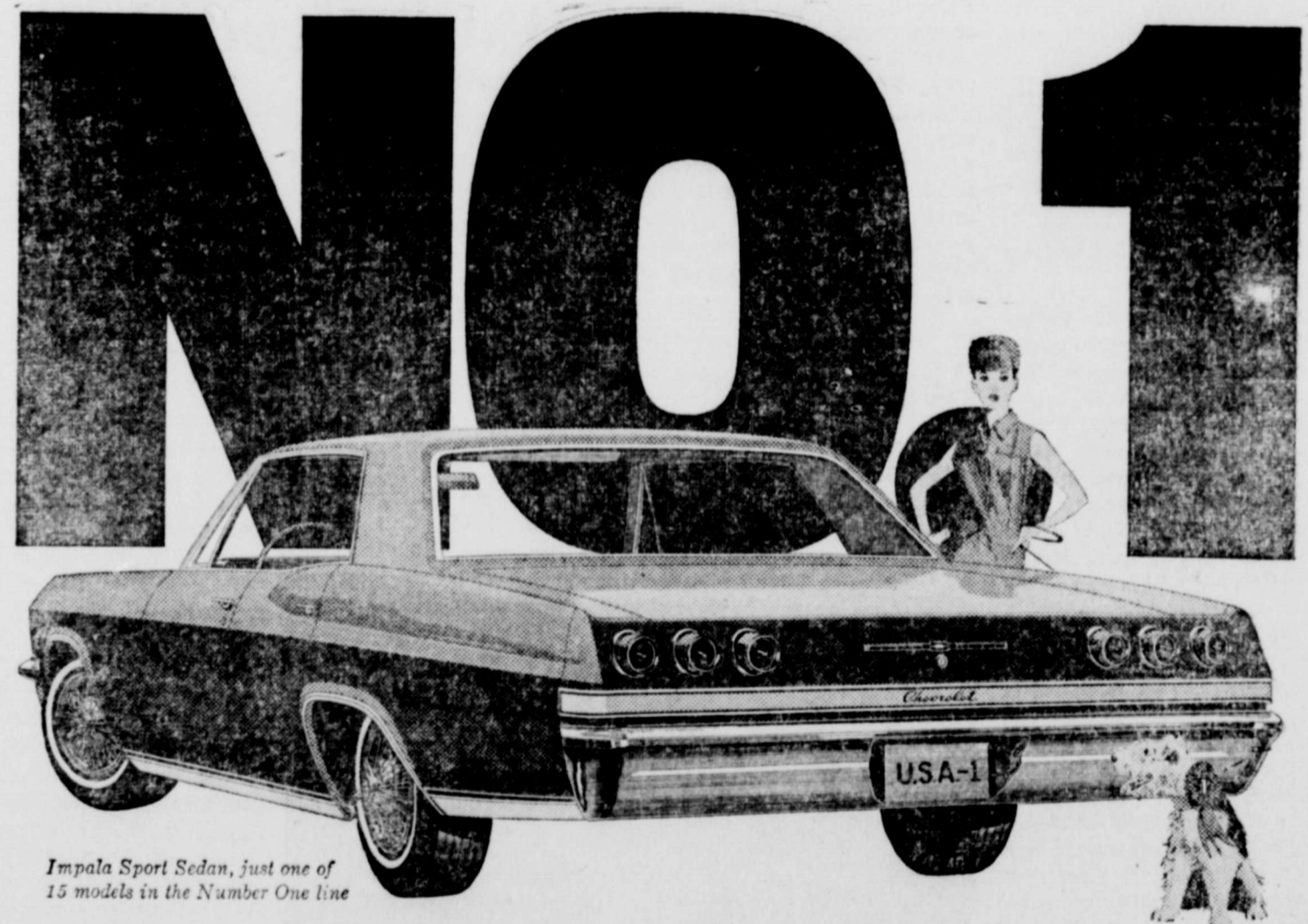
Impala Sport Sedan, just one of 15 models in the Number One line

Geigy CREATORS OF CHEMICALS FOR MODERN AGRICULTURE Caparol