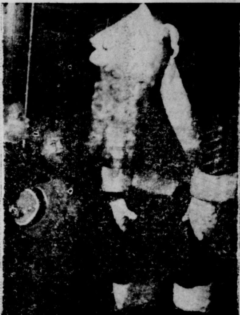
Santa Made "Official" Entry in December