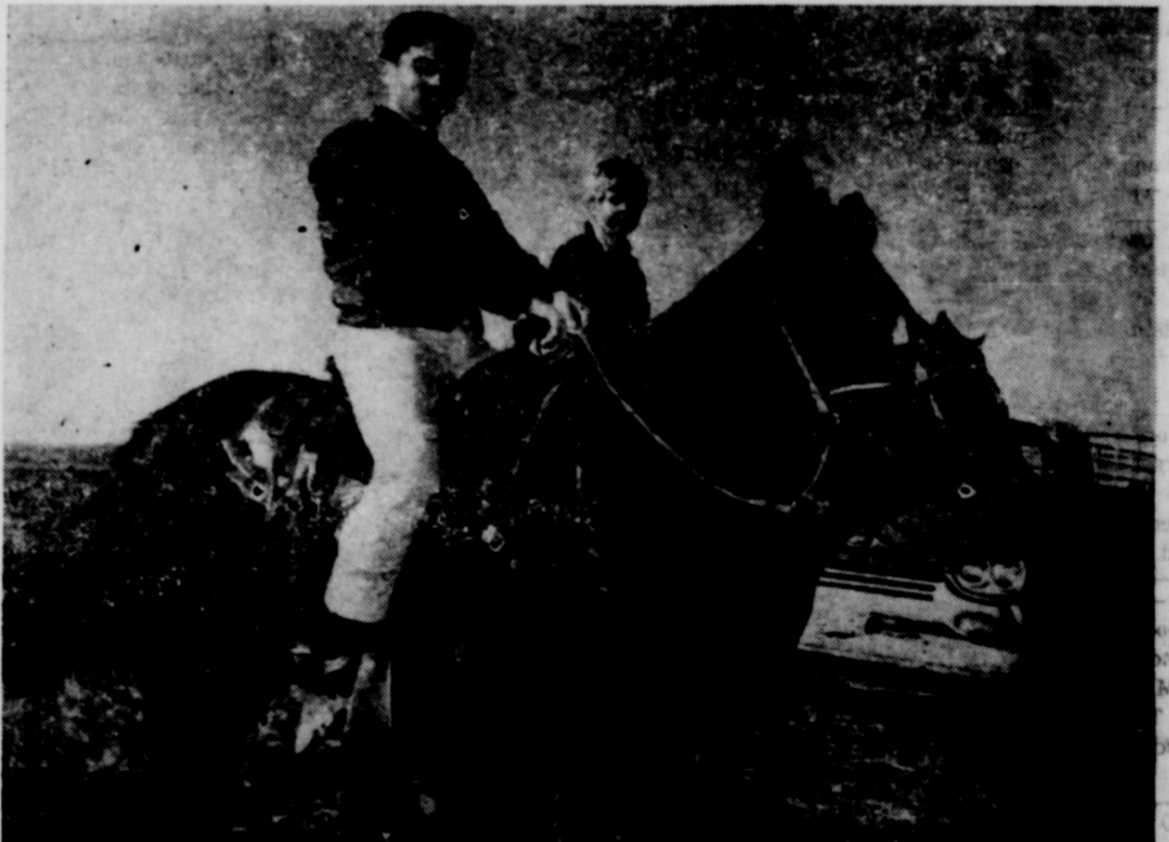
Merkel Riding Club Activities