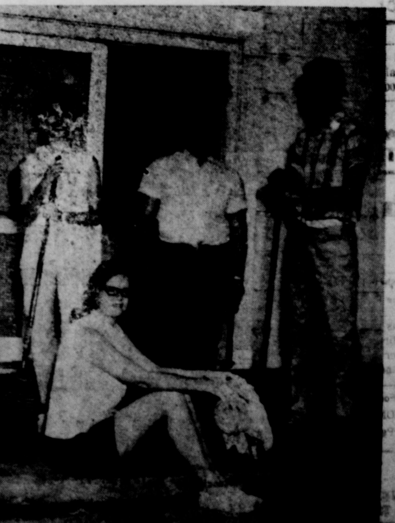
Opening of Teen Center