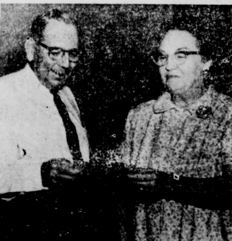
Merkel's First City Sales Tax Check