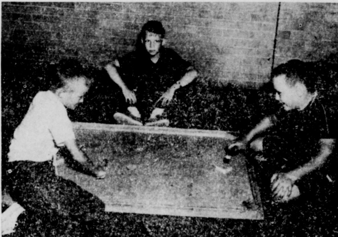
Summer Recreation Program