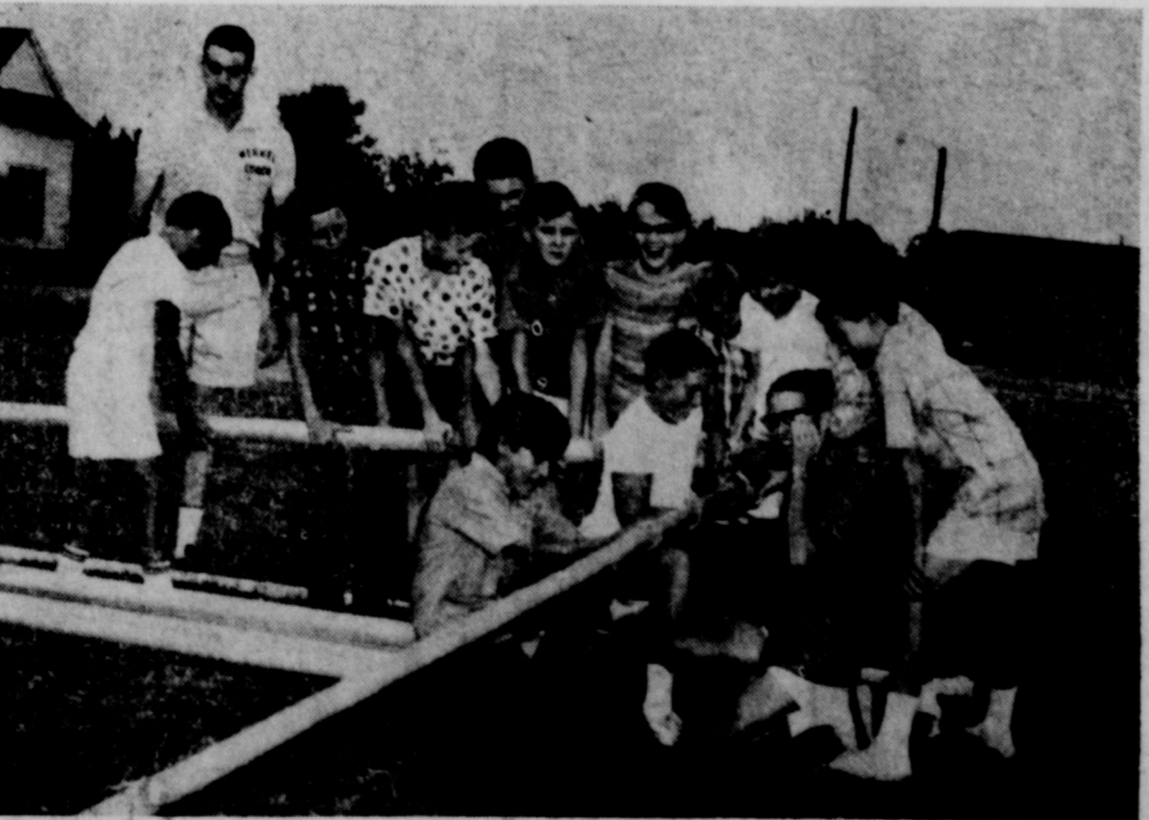
"Connecting" Merkel's 1968 P-TA Project