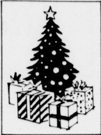
be constructed by stringing several ornaments together so they sway and dance in

Only the older children should handle scissors or needle and thread, of course. If all children are small, an adult should hang around unobtrusively to give an assist where needed. You may have to cut out basic star and snowflake shapes from the fabric, for example, and show the younger children how simple it is to stroke on paste and sprinkle on glitter.