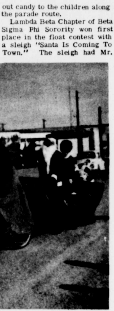
TAKES FIRST--Lambda Beta Chapter took first place in the float division at the annual Christmas Parade Saturday. The winning float depicted Mr. and Mrs. Claus in his sleigh being pulled by reindeer. The parade was sponsored by the Merkel Chamber of Commerce.

The children are excited and anxious to present their 20 minutes of recitations and songs. Together the programs will last one hour. All area churches and friends are invited and encouraged to attend this beautiful and meaningful Christmas story. Please come join us this Sunday at 7:00 o'clock.