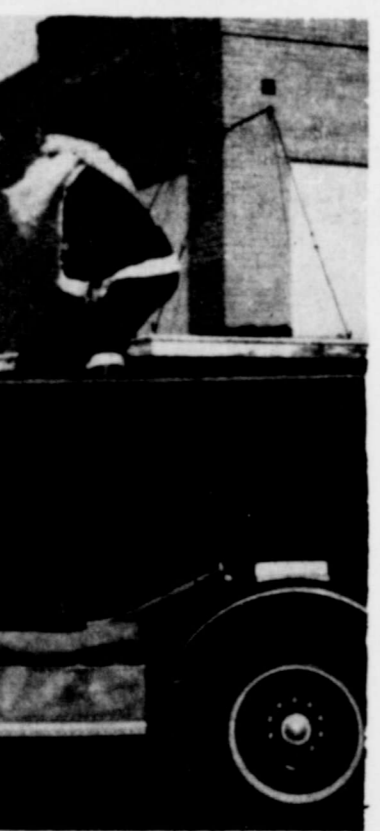
SANTA ATOP FIRE TRUCK ... throwing candy to children