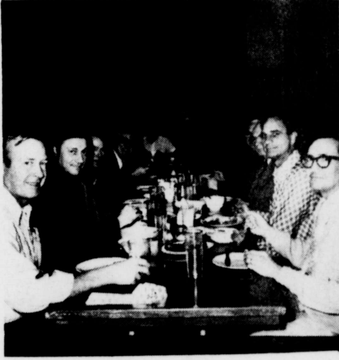
THE WINNERS ... eating steak