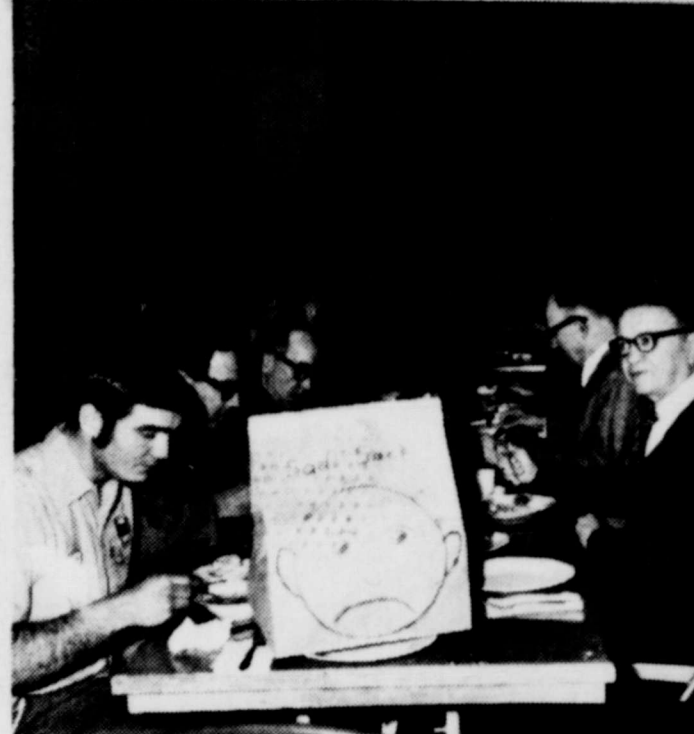
THE LOSERS ... sack tells story