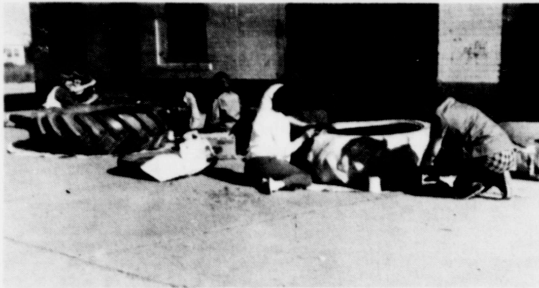
MERKEL 4-H CLUB ... painting tractor tires for City Park