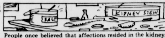
People once believed that affections resided in the kidneys.

Need wheat pasturage for light calves already worked and turned out—no health problems R.L. BLAND Jr. 915-862-2951 or 672-9362