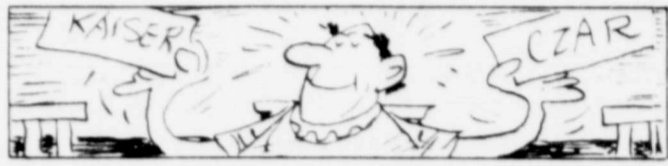
The titles Kaiser and Czar are both forms of Caesar.

iversity, Southern Methodist University, Southwest Texas State University, Southwestern University, Tarleton State University, Texas A&M University, Texas Christian University, Texas Lutheran College, Texas Southern University, Texas State Technical Institute-Waco, Texas Tech University, Texas Woman's University, Trinity University, Tyler Junior College, University of Texas at Arlington, University of Texas at Austin, University of Texas at El Paso, West Texas State University, Western Texas College, Air Force ROTC, Army ROTC, Navy ROTC, Financial Aid.