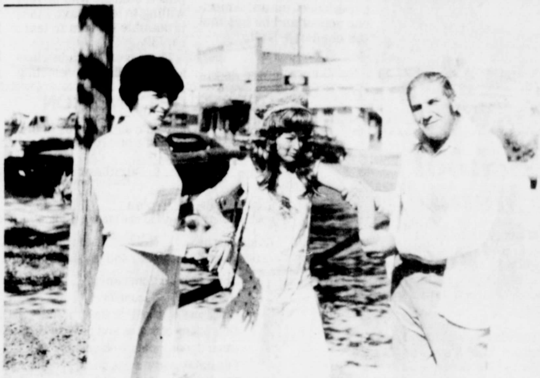
Crazy Daze Arrest

THOUGHT FOR THE DAY - Daily prayer is the guardian of the soul. God is faithful, and he will not let you be tempted beyond your strength, but with the temptation will also provide the ways of escape, that you may be able to endure it. - 1 Corinthians 10:13