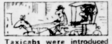
Taxicabs were introduced in London around 1823.