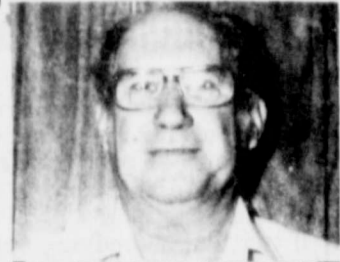
100 DOLLAR WINNER HALLOWEEN TREATS

PRICES GOOD THURSDAY FRI & SAT. OCTOBER 27-28-29