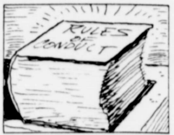
In China, at one period, there were 3,000 rules of conduct to be learned and obeyed.

Improvement in science and science lab, homemaking facilities, etc., are on the school boards five year program for improvement and may be included in a reconstruction of the high school building in whatever form that might take.