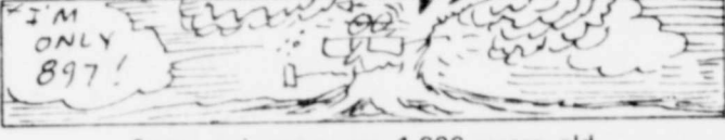
Some oak trees are 1,000 years old.

schools and at the Taylor Electric Cooperative office. Contestants will be required to give an eight minute talk on the subject of energy conservation. All entry forms must be returned to the Cooperative by May 1, 1978. The contest will be held May 8, 1978 at 7 p.m. at the Cooperative office, located at 1610 North First Street in Merkel. Teachers, parents, and friends are invited to attend the contest. Resource material is available through the Cooperative and related businesses.