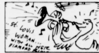
Swans communicate with a loud, trumpet-like sound.

"ATTENTION" Final Registration On April 1st Saturday From 10 A.M. To 2 P.M. At The West Texas Utilities Building. Registration Fee Is $5.00 All Boys Must Register Regardless Of Playing Last Year. This Will Be The Final Registration