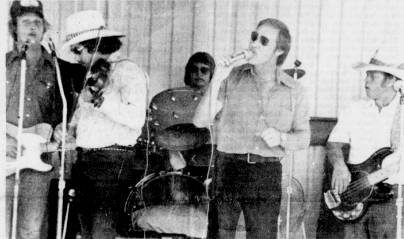
And The Halfbreed Reunite.