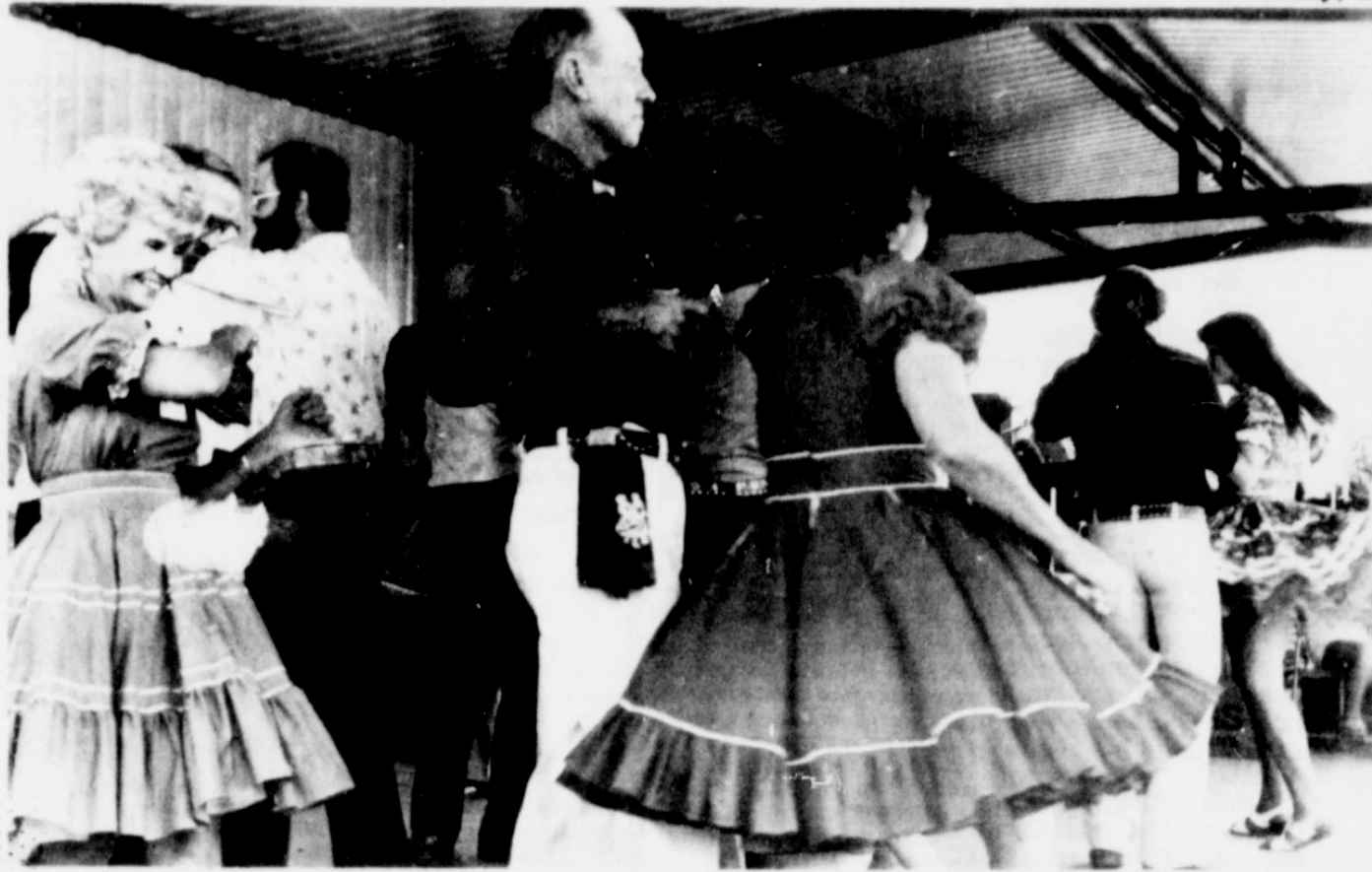
The Levis and Lace squaredancers put on a show at Friday's Fun Day held at the Merkel City Park.