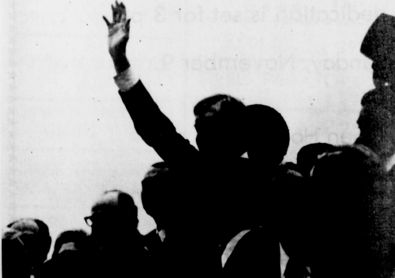
Although Merkel-Trent-Tye voters stayed with the President, Jimmy Carter, shown here campaigning in Abilene last week, lost his bid for