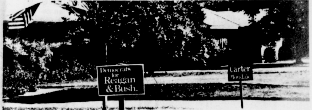
Tuesday's election did not prove to be as close as these two campaign signs on Sunset street here as the nation elected Ronald Reagan as it's

That transition needs to be made as smoothly as possible and it would be impossible for it to be a smooth transition, unless the electee has the majority of support from American people.