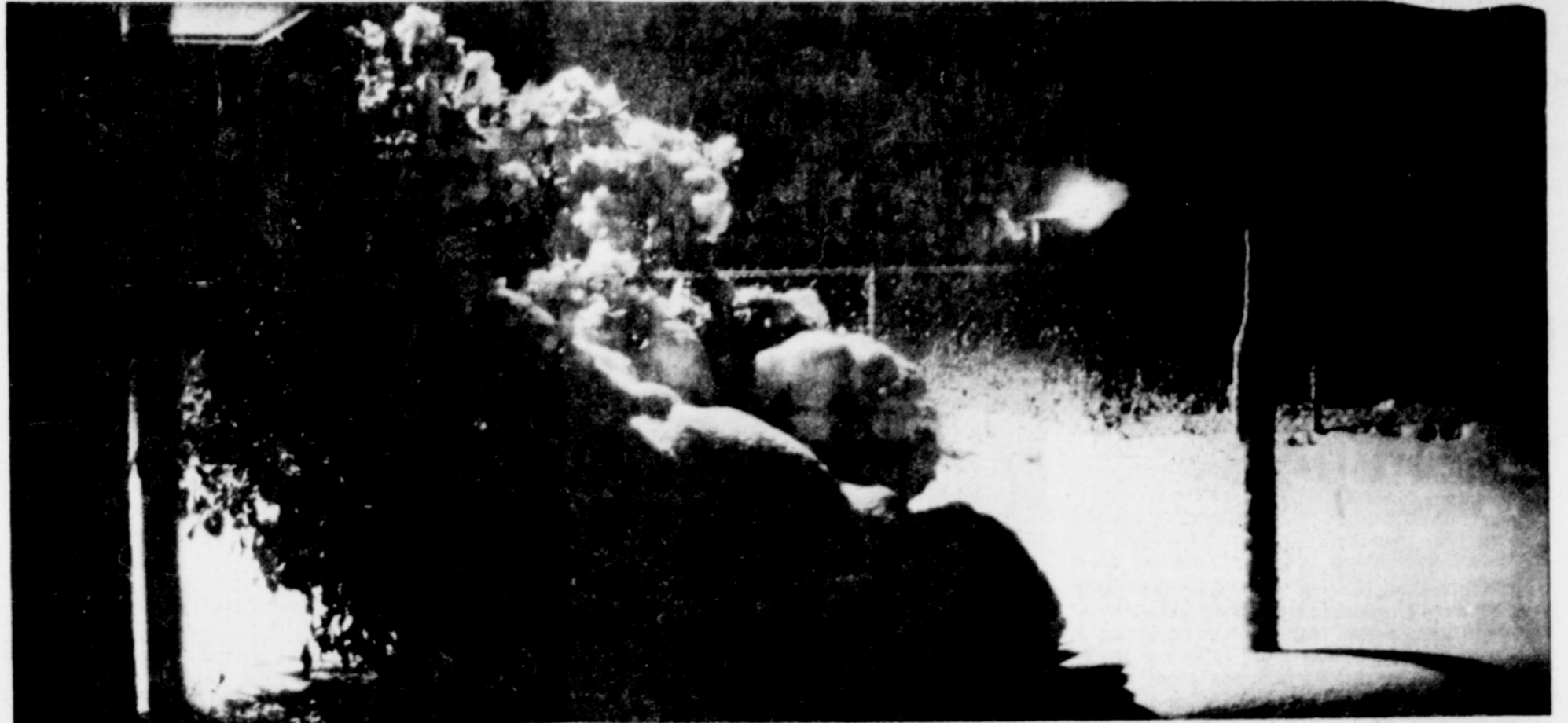
A bush, gas lamp, chain link fence reflect shadows only light and snow can produce.