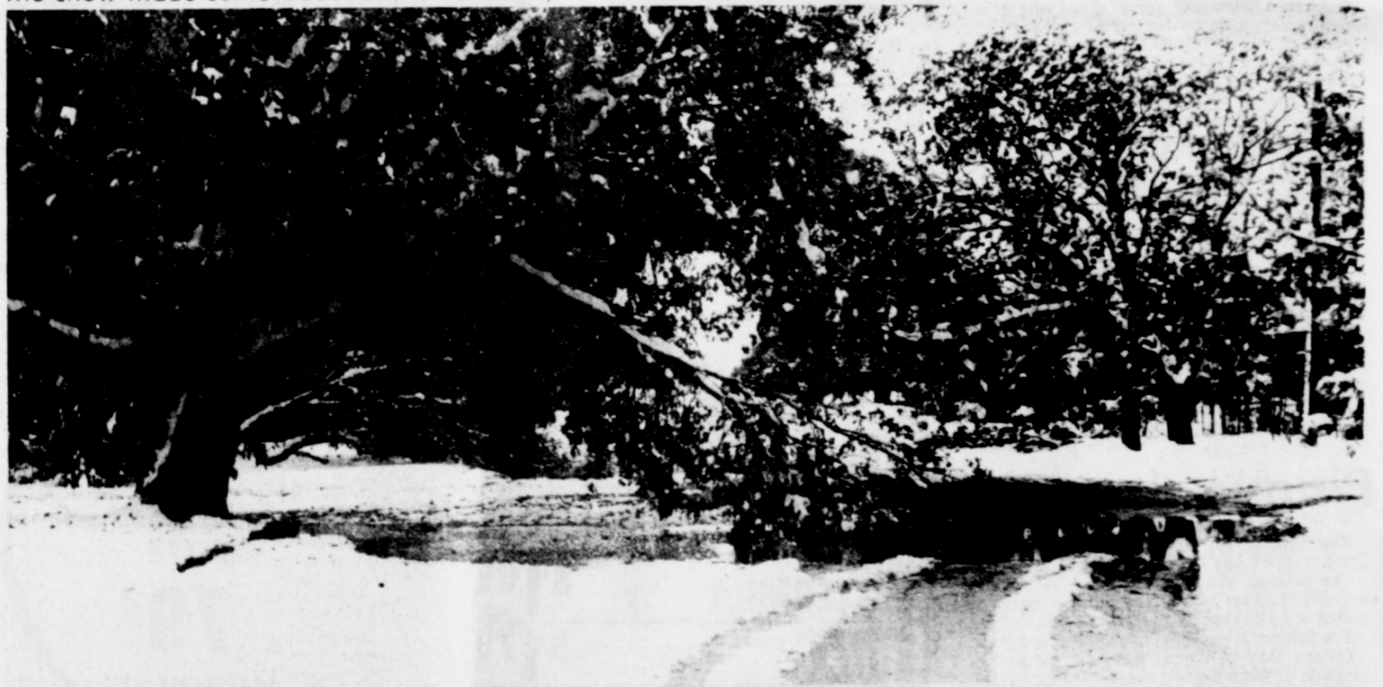
Mother Nature's form of tree trimming.