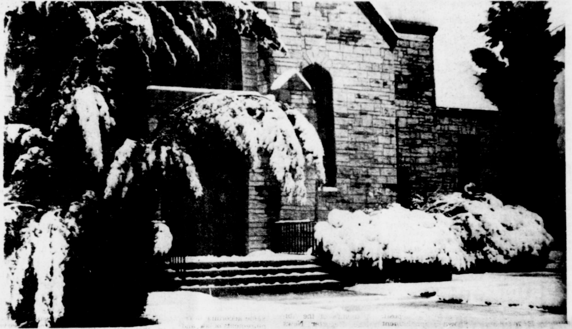
The snow made some trees take on odd shapes.