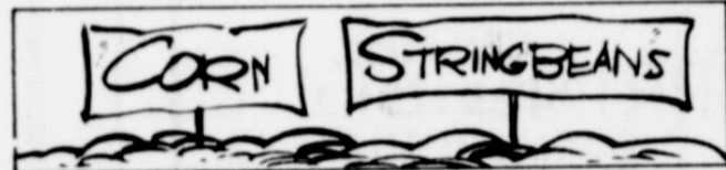
Indians planted stringbeans along with the corn crops. Corn, wheat and cotton deplete the land of its natural nitrogen. Bean plants replace this loss naturally. Only lately have non-Indian farmers learned to do this.

ROBY, TEXAS 776-2448 JACK McCLURE — 776-2229 JEFF McCLURE — 776-2541