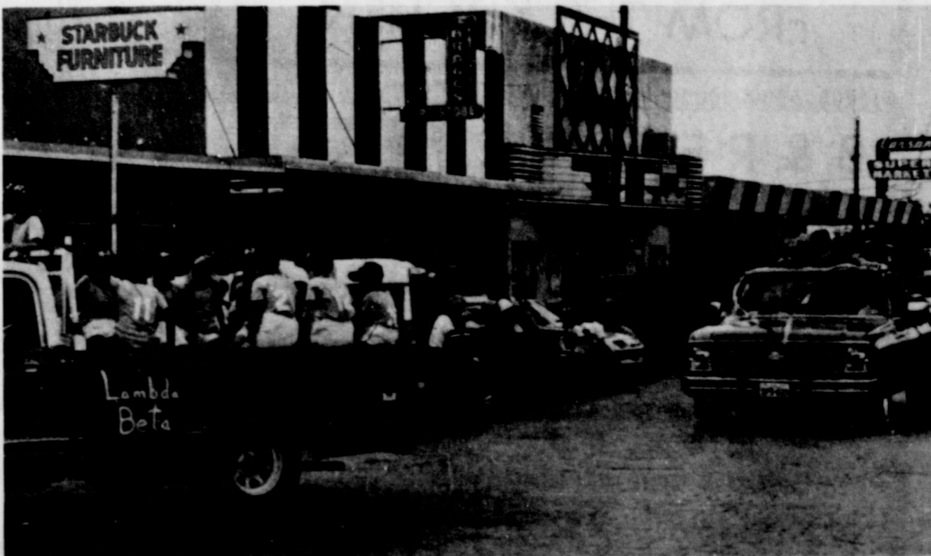
The Merkel Little League and the M-T United Girls Softball Association held their opening day

The Badgers are leaving for the regional meet in Lubbock Thursday and the field event will be held Friday with the running events on Saturday. Watch next week's Mail for results.