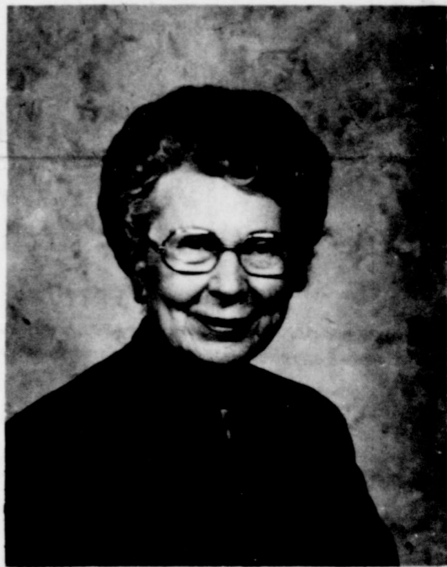
due in her winning the award-the support and help of the Fortnightly Study Club.