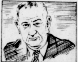
Lyndon B. Johnson was the first President to be sworn into office on an airplane.