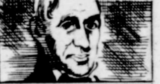
The President who served the shortest time in office was W.H. Harrison, who only served one month, in 1841.