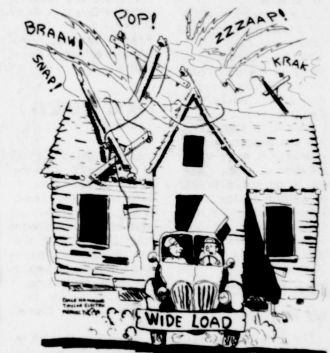
I GOTTA GET A TUNE UP ON THIS CRATE. THE NOISE IS DRIVIN' ME CRAZY!

Look forward for them to be making that trip frequently in the years to come.