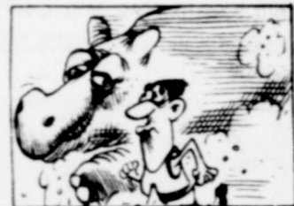
A typical hippopotamus can run faster than an average man.

The welcome mat is always out at Starr. We appreciate your visits.