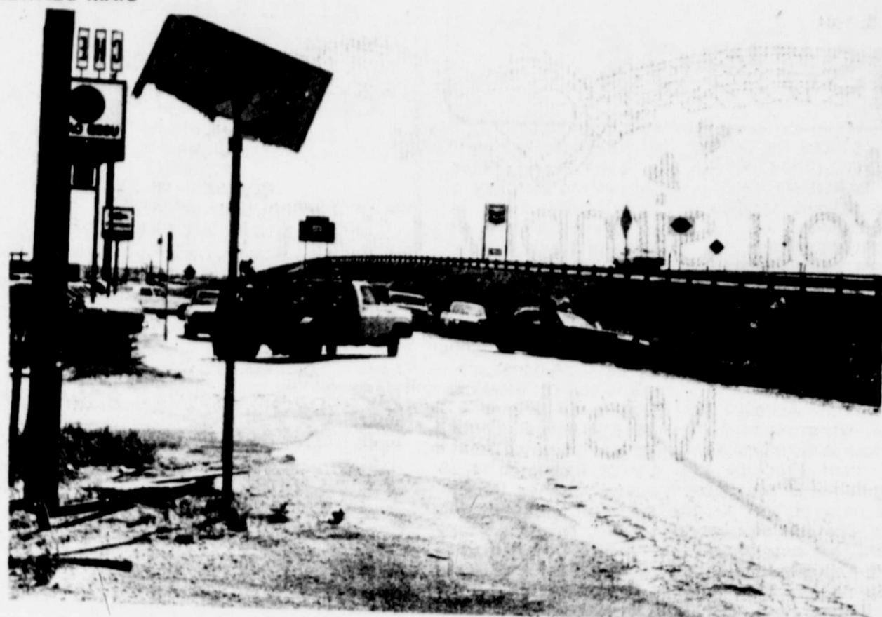
As you can see from the skid marks and the crumpled sign, the car coming off the Interstate Thursday afternoon was going a little too fast and couldn't regain control. Merkel police had the scene cleared up quickly.