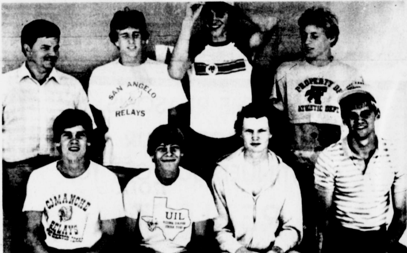
The Merkel High track team will have seven individuals in the regional meet this weekend in

Applications are available at Merkel Drug, The Merkel Mail or at City Hall.