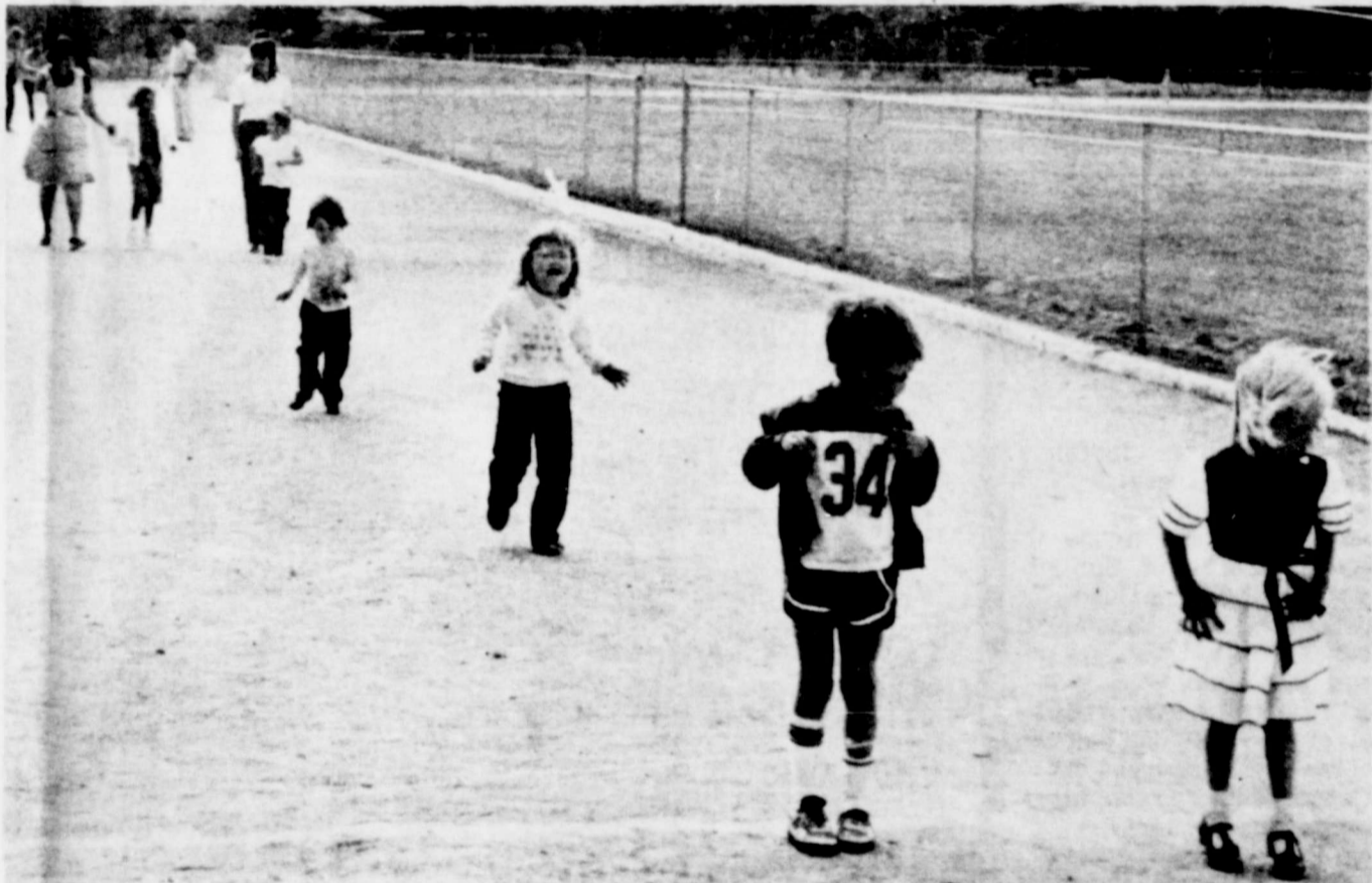
These youngsters didn't quite know what to do at the finish line, so they stopped, quickly. They were some of the more than 500 Elementary and pre-school children that participated Monday.