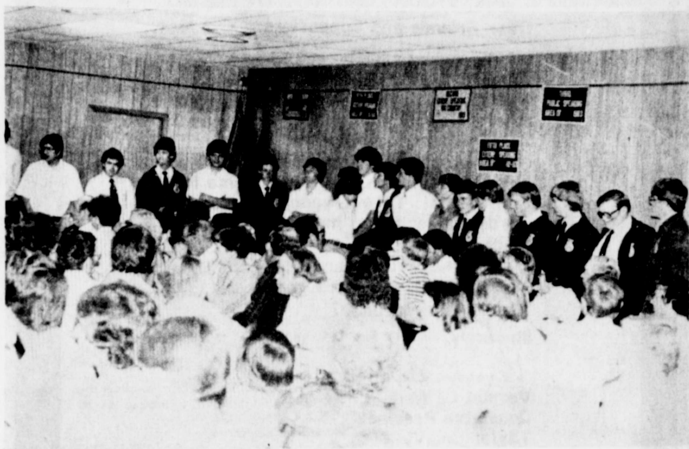
The Merkel FFA held their annual awards banquet Monday night at Heritage Hall. The event drew almost 200 people, a full house at the hall.