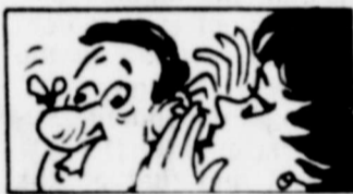
If a fly lands on your nose, they say, somebody has something to tell you.