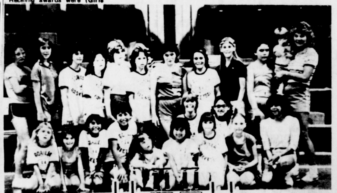
These are the participants of the recent Gorilla basket ball camp.