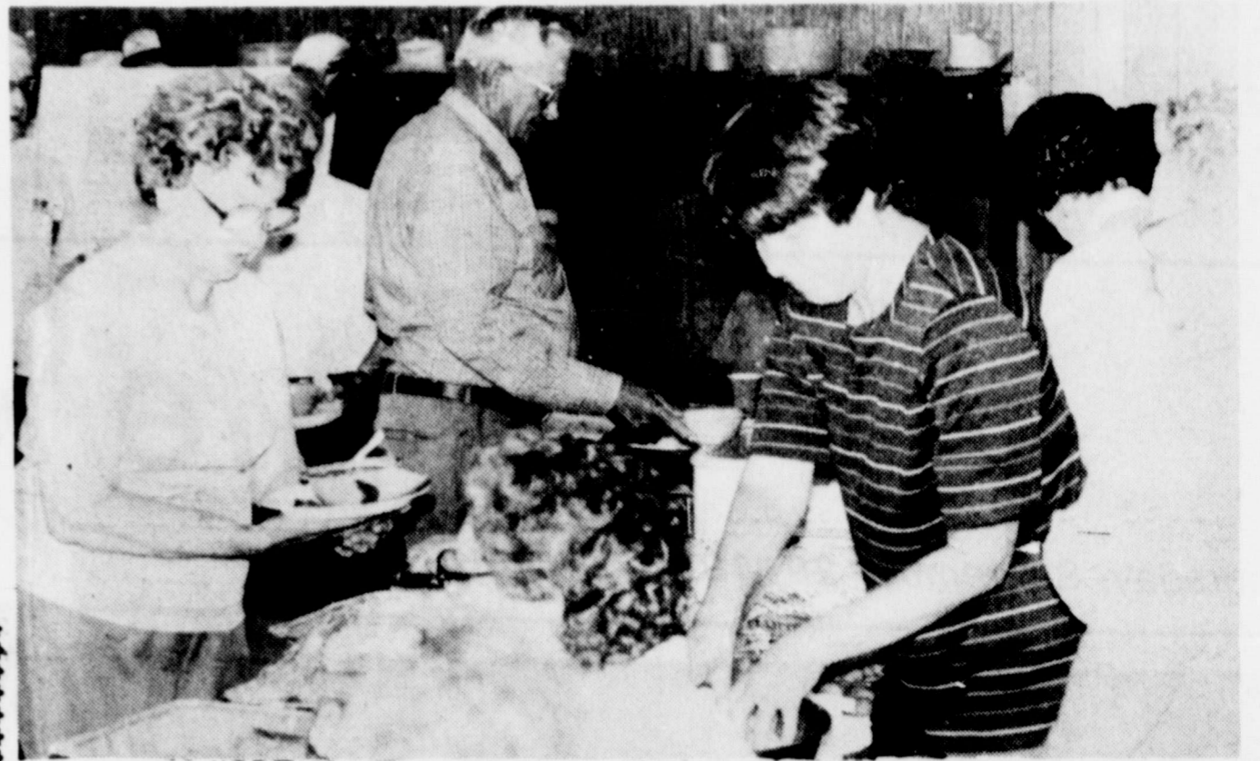
§ Thursday's fund raiser in benefit of the Taylor County Senior Citizen's Nutritional Program drew a full house at Heritage Hall.

GALLOWAY ELECTRICAL & PLUMBING FREE ESTIMATES APPLIANCE REPAIR CALL 928-5356