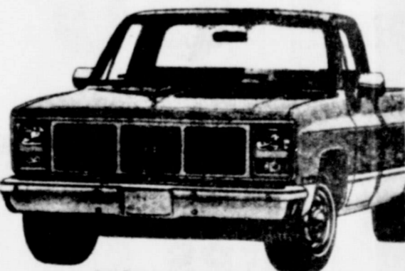
G/K Pickup Sierra Classic

Underfoot there's plush wall-to-wall deep-pile carpeting, overhead a cloth-covered insulated headliner. Vinyl door trim includes insert panels of elegant brushed pewter-tone, color-keyed cloth, and carpet.