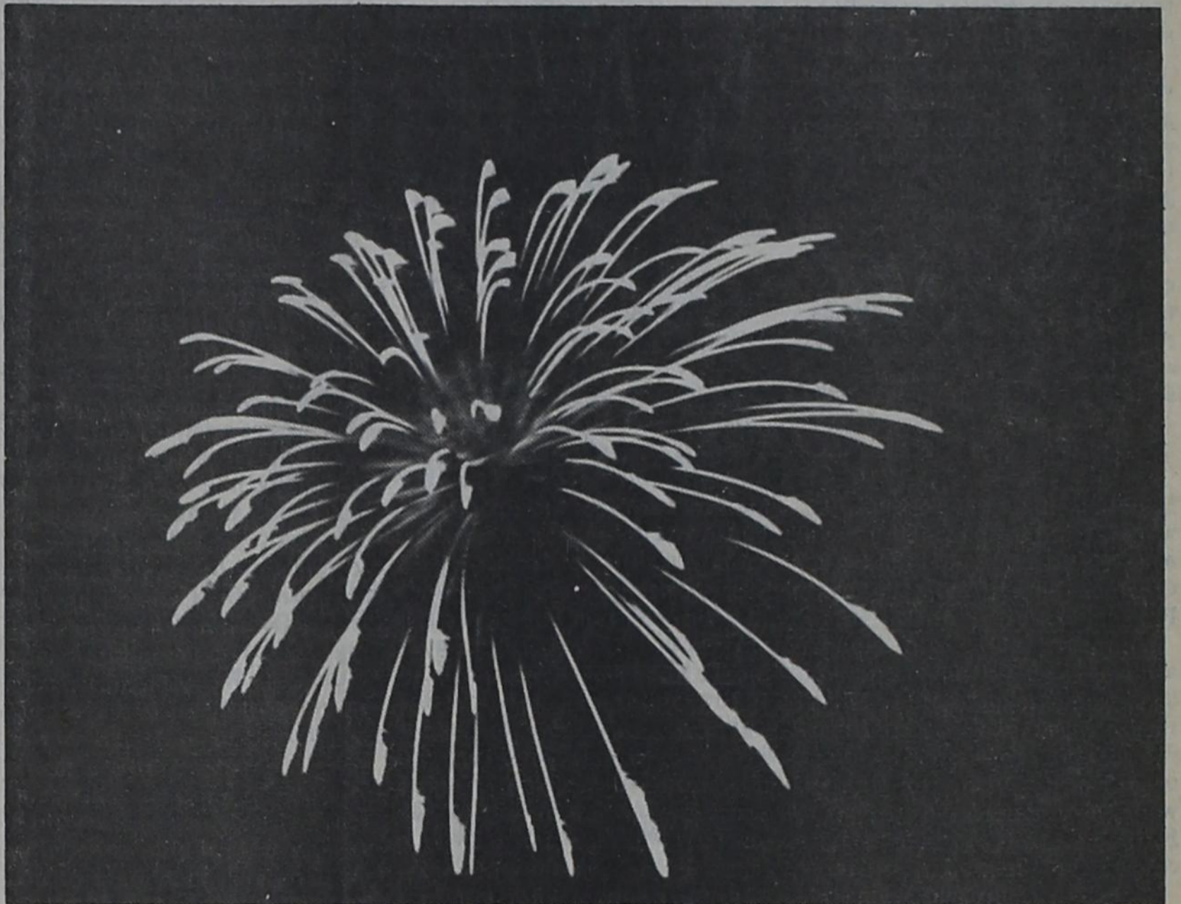
FIREWORKS.... Just one example of the many pretty displays which were put on for residents of the Bovina area at the July 4 fireworks display. A good crowd attended the display, held at the Bovina Football Stadium, and was a good way to end a fun-filled day of activities.