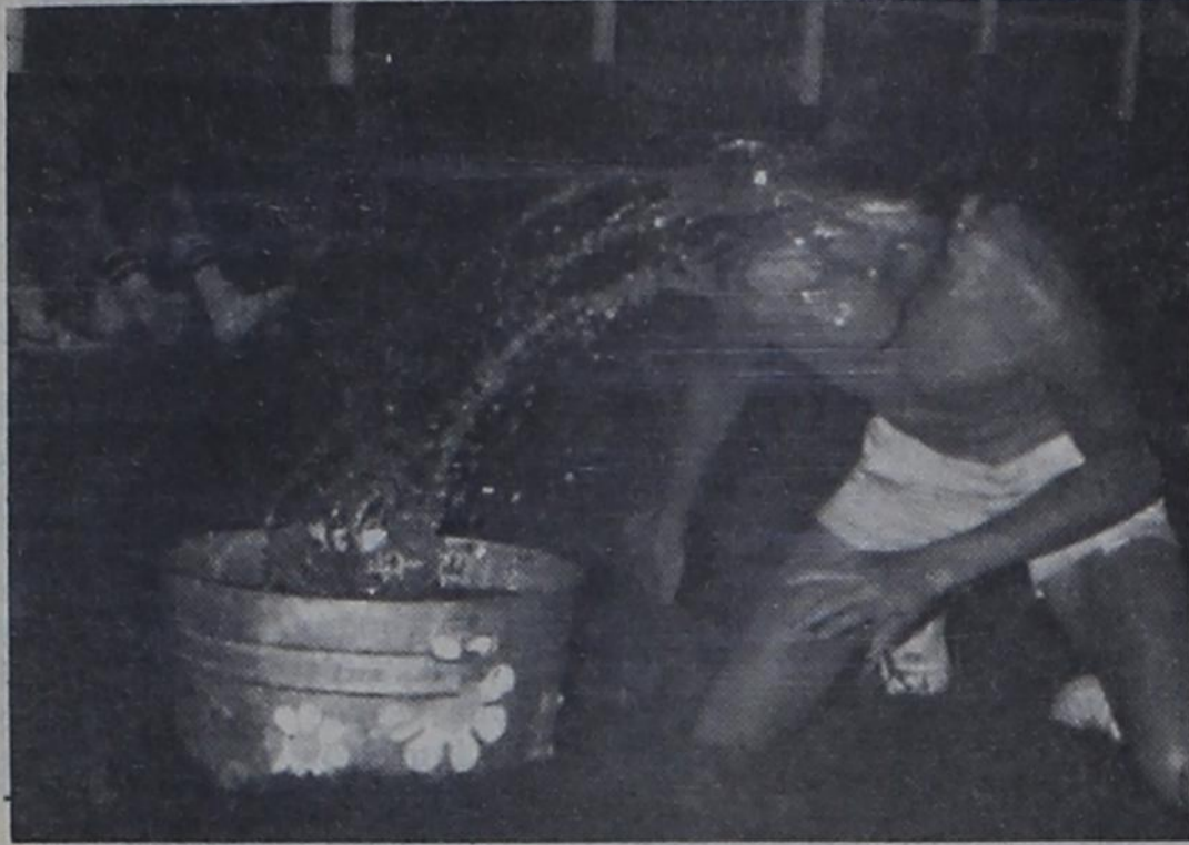
GRAB THAT NERF.... One of the July 4th crazy events of Almost Anything Goes was to crawl a distance, reach in the tub of water containing Nerf balls, get the Nerf ball with your teeth and crawl back to the starting point.