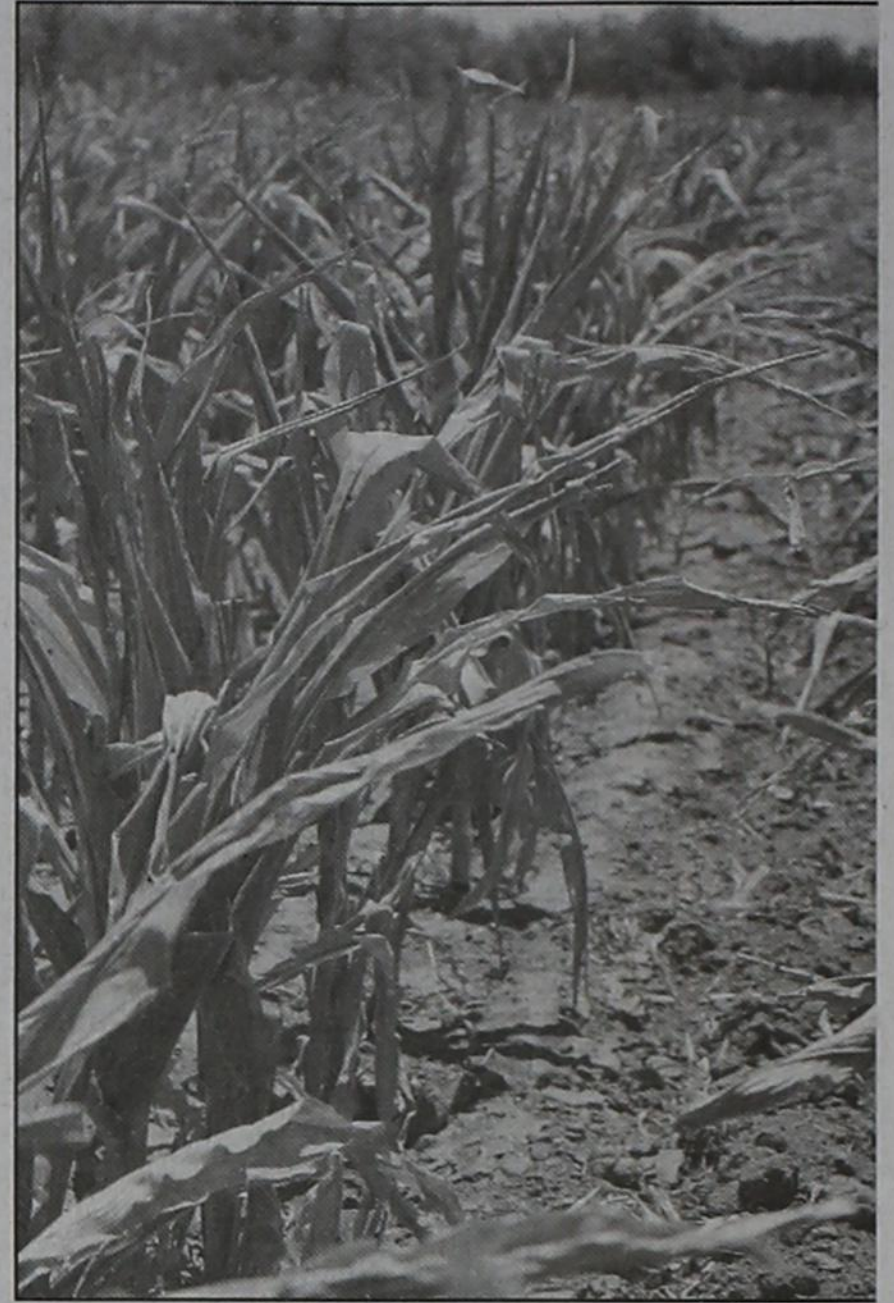
Corn prices continue to reach record highs as a result of drought in the Midwest. This corn crop near College Station failed as part of the 2011 Texas drought, costing the state a record $7.62 billion in agricultural losses.