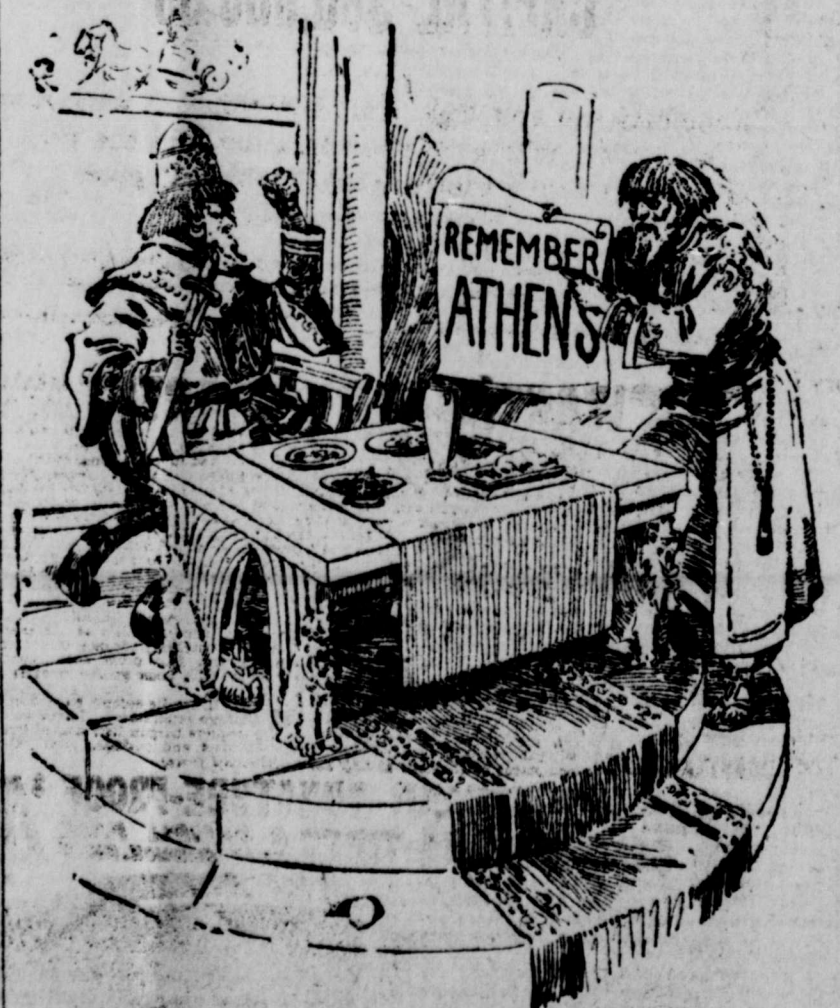
SIRE, REMEMBER ATHENS

IN ORDER that vengeance might not slumber, King Darius had his secretary to say to him each morning, "Sire, remember Athens," and the Persian army was cut to pieces in the battle of Marathon. Hannibal laid his hand on the altar and swore vengeance against Rome, and the Carthagian army was annihilated on the plains of Italy. Many a nation has gone to destruction or wasted its energy in blindly following its leaders in an effort to avenge grievances.