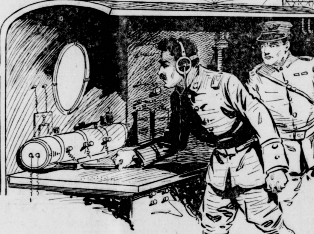
She Gave Them an Exhibition.

Then it will not be a question of the annihilation of armies; it will be one of the extermination of whole populations. It will not be a matter of demolishing cities and fortresses, but of wiping whole nations at one stroke from the face of the earth. The scientists, in fact, offer us one ultimate alternative: Either man must conquer his innate murderous instincts and cease from war, or else in the end the human race will perish in a universal act of suicide such as Schopenhauer foretold—self-slain by the unspeakable agencies of destruction with which science will inevitably arm us.